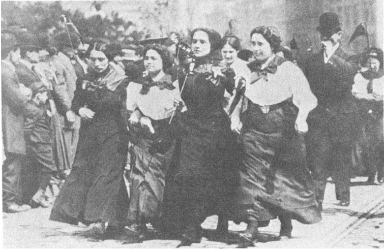
In 1909, garment workers in New York City rose up and demanded better wages and working conditions.

realistic tradition of Mark Twain. He was an active participant in the revolutionary workers' movement in the U.S., and his short stories and political writings relentlessly exposed the American bourgeoisie's parasitic life, lambasting them for poverty of spirit and insatiable greed. His famous works include Call of the Wild , A Daughter of the Snows , The Iron Heel and Martin Eden .