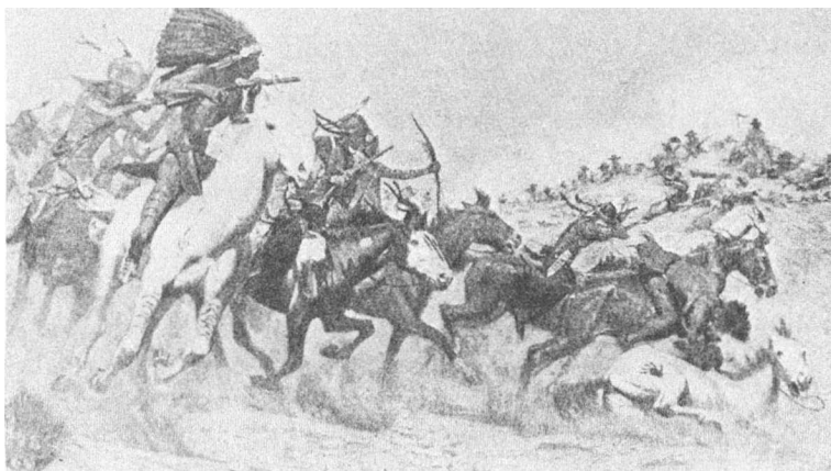
The combined armies of the Sioux and Cheyenne defeated Custer at the Little Big Horn, Montana on June 25, 1876

The rise of U.S. imperialism brought serious hardships to the working class and other working people. 26 Each day marked the further impoverishment of daily life and erosion of political rights. As capitalism advanced to the monopoly stage, the ranks of the proletariat grew rapidly in size and concentration, and a broad and vigorous labor movement began. Marx's comrades-in-arms Sorge and Meyer organized the American branch of the First International in 1867, stimulating the working class movement as they spread Marxism, struggled against every kind of opportunism, fought for the eight-hour day and expanded the strike movement. In 1869 workers organized the Knights of Labor, considered by Engels to be the first nationwide organization established by the U.S. working class. The great Pennsylvania railroad strike erupted in 1877 as the first large-scale strike movement in U.S. history. On May 1, 1886, several hundred thousand workers struck and demonstrated in Chicago, Washington, New York and many other large cities, achieving a great victory in the struggle for the eight-hour day. Meeting in Paris in 1889, the second congress of the International resolved that, beginning in 1890, workers around the world would demonstrate and