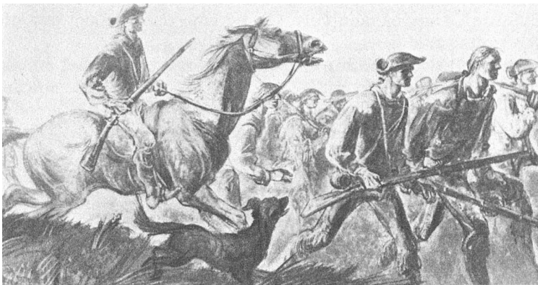
The Green Mountain Boys of Vermont were one of many guerrilla bands who fought in the War of Independence.

The North American War of Independence was a war in which a weak country defeated a strong one, a small country defeated a big one. At that time England occupied the superior position as the world’s first great industrial nation, with a population of 30 million; the armies they sent to America were 90,000 men strong, all equipped with fine weapons. The North American colonies were in a completely inferior position, with a population of only three mil-