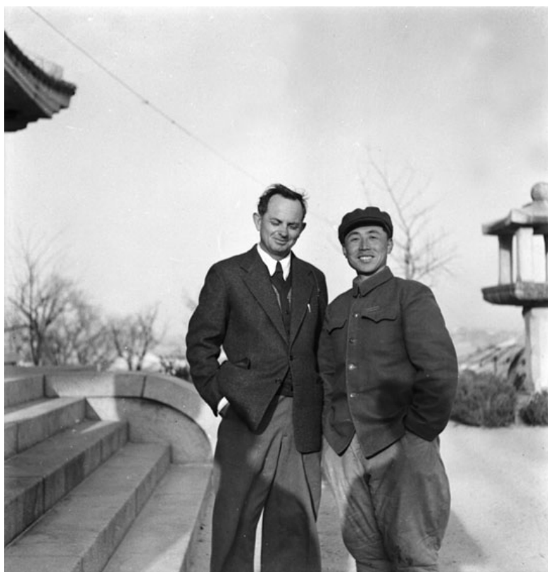
Wilfred Burchett with Hsio Ch'en, Kaesong