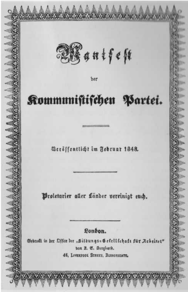
Cover of the 1848 (30-page) edition of the Manifesto of the Communist Party