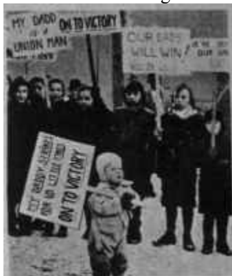
along with strikers' children