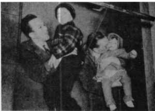
Visiting hour at Fisher Body

This exposure proved a boon to the workers’ cause as it hit the front pages of every paper in the country and exposed GM’s complete control of the political machinery of Flint. But the company had just started.