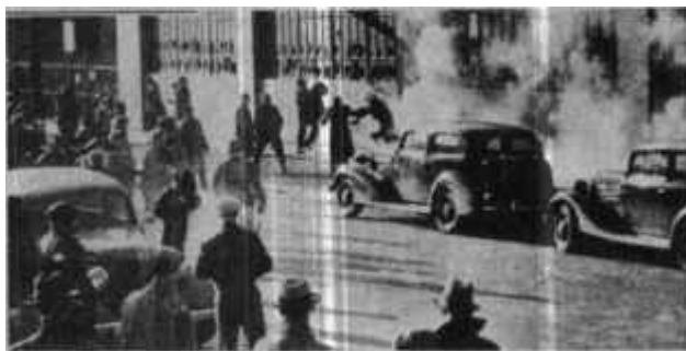
Breaking windows at Chevy 9 battle