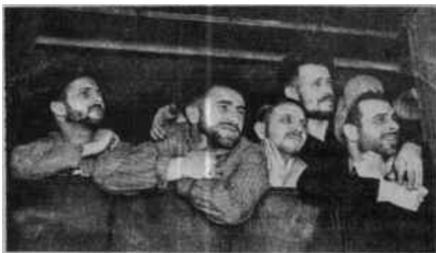
Strikers inside Fisher Body No. 1

soul. GM ran Flint like a feudal barony. Eighty per cent of the population of 150,000 were directly dependent on GM for livelihood, 20 per cent indirectly. Forty-five thousand men and women toiled in the GM Flint plants, heart and me eve center of the corporation's world-wide empire. In the summer of 1936 every city official – the mayor, city manager, police chief and the judges – were GM stockholders or officials, or both. The only local newspaper, The Flint Journal , was 100 per cent GM, all the time. The corporation controlled the radio station directly: even paid-for time was denied the union during the fight for unionization. The school board, welfare department and all other government agencies were directly under the thumb of the corporation. Billboards throughout the city acclaimed “the happy GM family.”