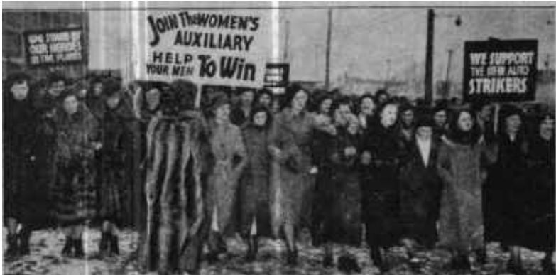
The 'Red Berets' march through heart of Flint...

With world-wide interest focused on that "war," the stage was set for a showdown.