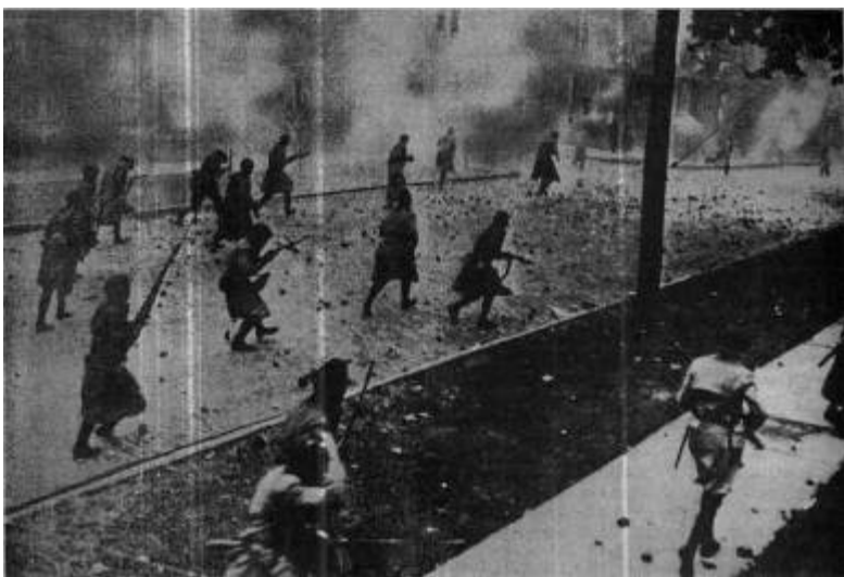
AN EARLY BATTLE ... National Guardsmen attack in 1934 Toledo Autolight strike and...

But it was the speed-up that made life intolerable. A wife described her husband as "coming home so dog tired he couldn't even walk upstairs to bed but crawled on his hands and knees."