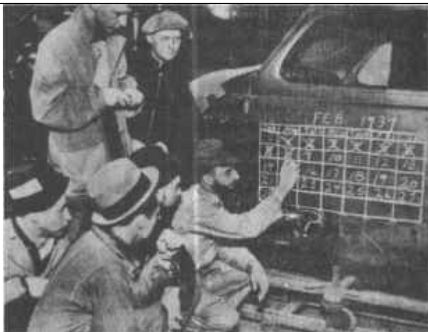
Counting the days... Feb. 9, 1937