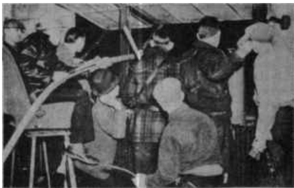
Strikers prepare to “fire” hoses at Bulls Run

When the first gas bombs were thrown, the pickets outside retreated temporarily. The wind blew the gas back into the cops’ ranks. Inside the plant the sit-downers dragged fire hoses to the windows and began directing streams of water at the advancing cops. Two-pound door hinges began raining down from the roof. Within five minutes, the cops retreated.