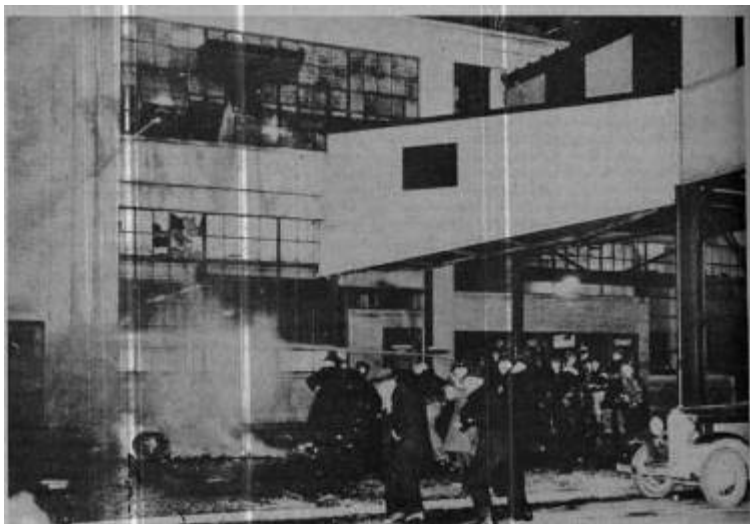
Cops defeated at Bulls Run (note streams from hoses, upper left, lower center)

The courage, organization and solidarity of the workers had overcome this strategy. The “Battle of Bulls Run,” as it later came to be known, had ended. The “bulls” had run.