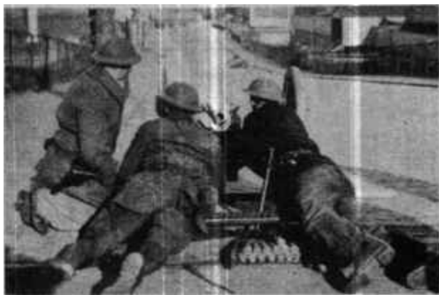
Machine guns aimed at Chevy No. 4