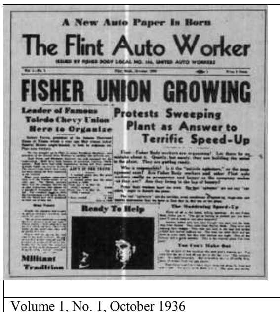
Volume 1, No. 1, October 1936

from the outside because they did not have the strength to maintain the sit-down. It was the Flint workers who had to carry the ball.