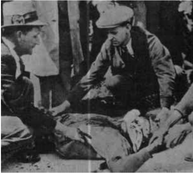
...An auto worker dies – but the union won.

a conveyor, and as each passes, the worker has to finish his particular job before the next one bears down on him. The line moves fast and the chassis are close together. The men move like lightning. Some are underneath on their backs on little carts, propelling themselves by their heels all day long, fixing something underneath the chassis as they move along.” 8