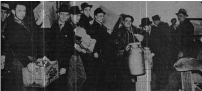
Bringing in the food to Fisher Body

Had the communists developed a long-range strategy for socialist revolution, or at least stuck to the concept that a working-class smashing of the ruling-class state was necessary, along with establishment of a workers' state apparatus, then they and thousands of workers would not have fallen into the trap of reasoning that events would depend on who pushed the "neutral," "democratic" Roosevelt harder, GM or the auto workers.