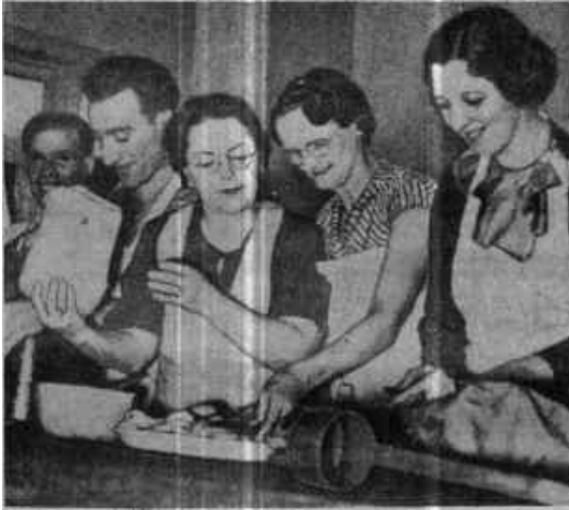
Strikers' wives prepare hot meals

and carefully guarded against poisoning. As it later turned out, a Pinkerton agent was on the inside food committee.