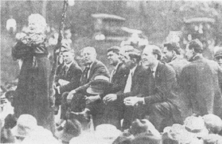
A steel strike meeting in 1919, near Pittsburgh. Foster(extreme right, first row on platform) listens as “Mother” Jones speaks to strikers.

A quiet determined man, he proceeded in a systematic way to accomplish in a few months, against all odds, almost single-handed, what the New Republic called “a miracle of organization.” The Journal of Political Economy of that day commended “his remarkable ability.”