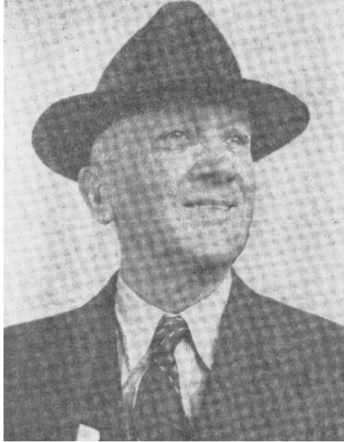
William Z. Foster, National Chairman, Communist Party

History has a long-range perspective. It ultimately passes stern judgment on tyrants and vindicates those who fought, suffered, were imprisoned, and died for human freedom, against political oppression and economic slavery. Pioneers who were reviled, persecuted, ridiculed and abused when they fought for free public schools, woman's suffrage, against chattel slavery, for labor unions, are