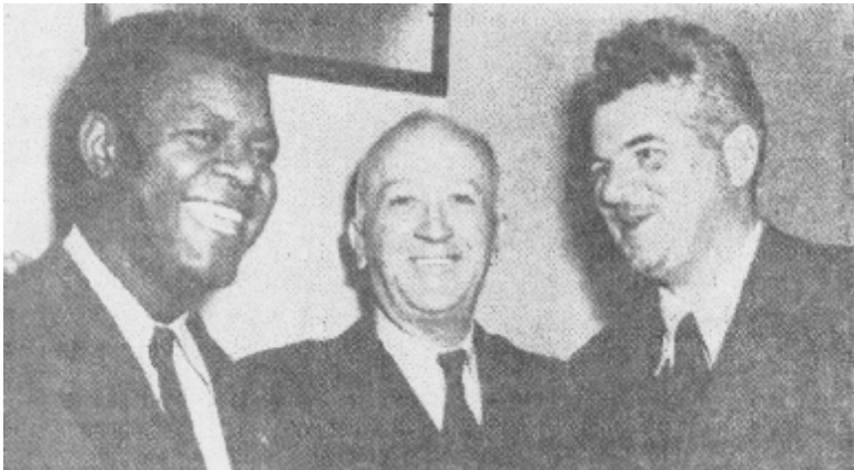
Henry Winston, Organizational Secretary of the Communist Party and Eugene Debs, General Secretary, with Bill Foster, 1948

As great mass defense movements were built around these famous labor cases of past decades, I urge you to join in building such a movement today - to defend not only "the 12" - but the Bill of Rights and 12 times 12 million Americans. History will give these men their place as 12 bravest and best Americans. Why wait for history, workers in mines, steel plants, packing houses and railroads? Remember the seven years' agony of Sacco and Vanzetti! Don't let it be repeated.